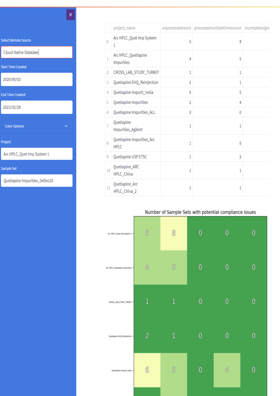
Figure 3. Compliance

Leveraging Native Datalake, we created EDA (Empower Data Analytics), an application that provides dashboards of aggregated data from an organization's many systems.