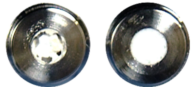
Figure 2. Pictures of the packed bed of CORTECS HILIC (left) and BEH HILIC (right) columns after high pH stability testing.

After testing, select columns were opened to determine if bed loss occurred. Figure 2 shows the packed beds of a BEH HILIC and CORTECS HILIC column after testing. As the images show, the hybrid particles show no signs of bed loss while the CORTECS HILIC bed is obviously degraded and a void has formed.