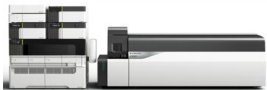
Fig. 1 Shimadzu LCMS-8045