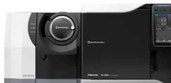
Fig. 2 Shimadzu GCMS-TQ8040 NX